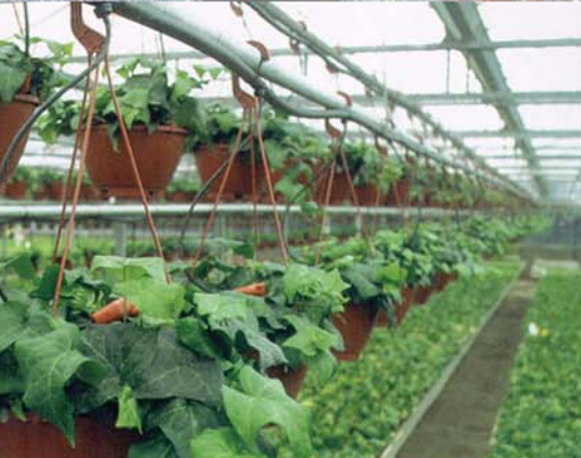
Dripperline System for Hanging Baskets