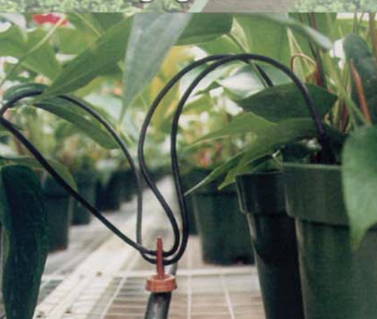
4 Way Multi-Outlet Drippers for Bench Pots

During these times you need a solution to your water problem. Make that solution "The Total Growing Solution" from Netafim USA.