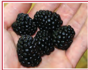
Mid June Trailing